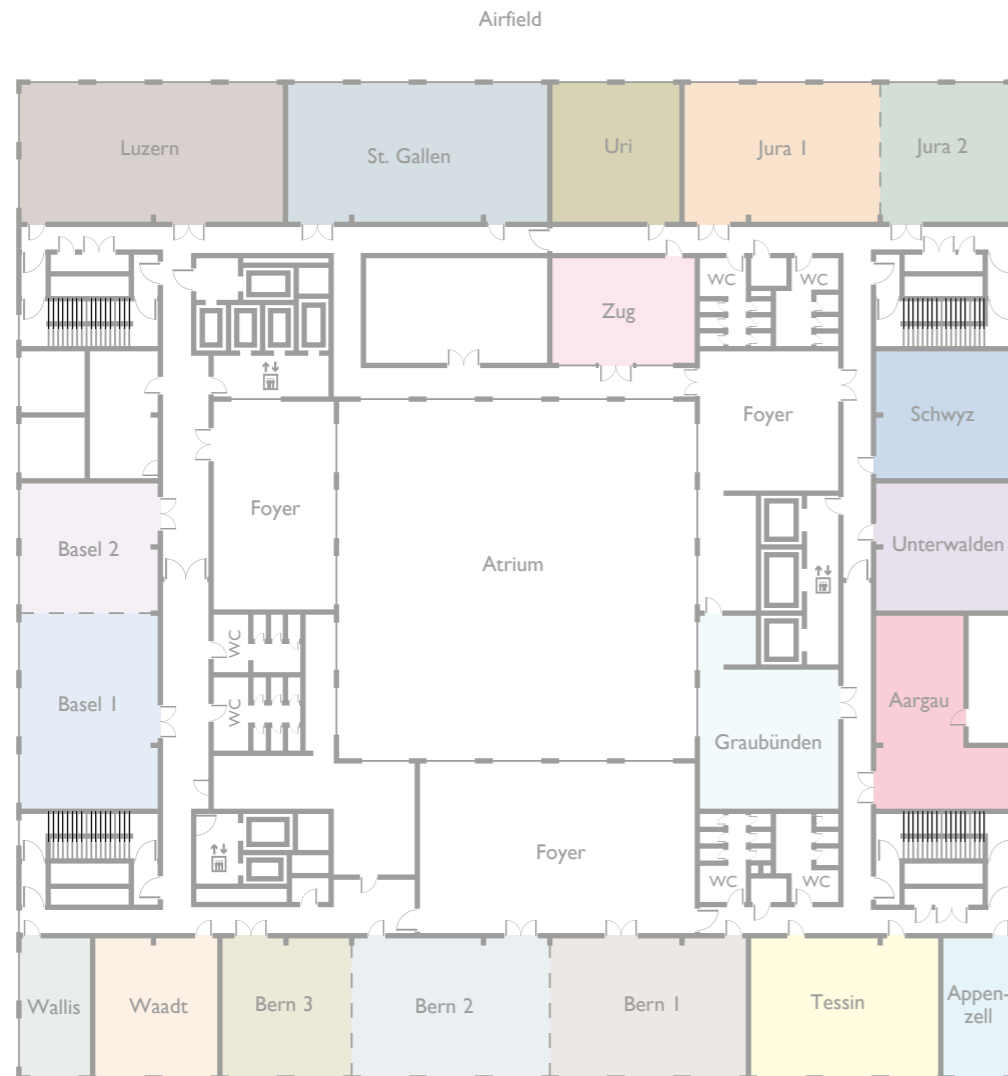
MEETING ROOM CAPACITY 7 TH FLOOR